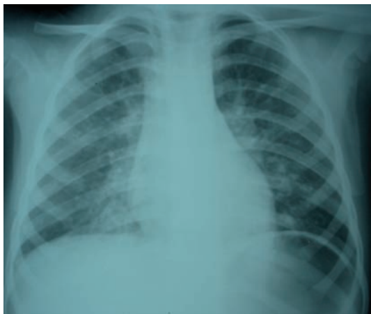
Fig. 23 X-ray image: Pneumonia

the patient is able to have a fever, the organism can still regulate itself. As can be seen in Table 2, homeopathy has enough remedies that can develop great healing power on the threshold from the syphilitic or carcinogenous to Sycosis and in Sycosis. If pneumonia occurs in its acute form, a brief allopathic treatment may be necessary. However, a holistic treatment should be initiated at the same time to look beyond the remedies to the conflict, which usually contains the victim stance in addition to the fear of death conflict.